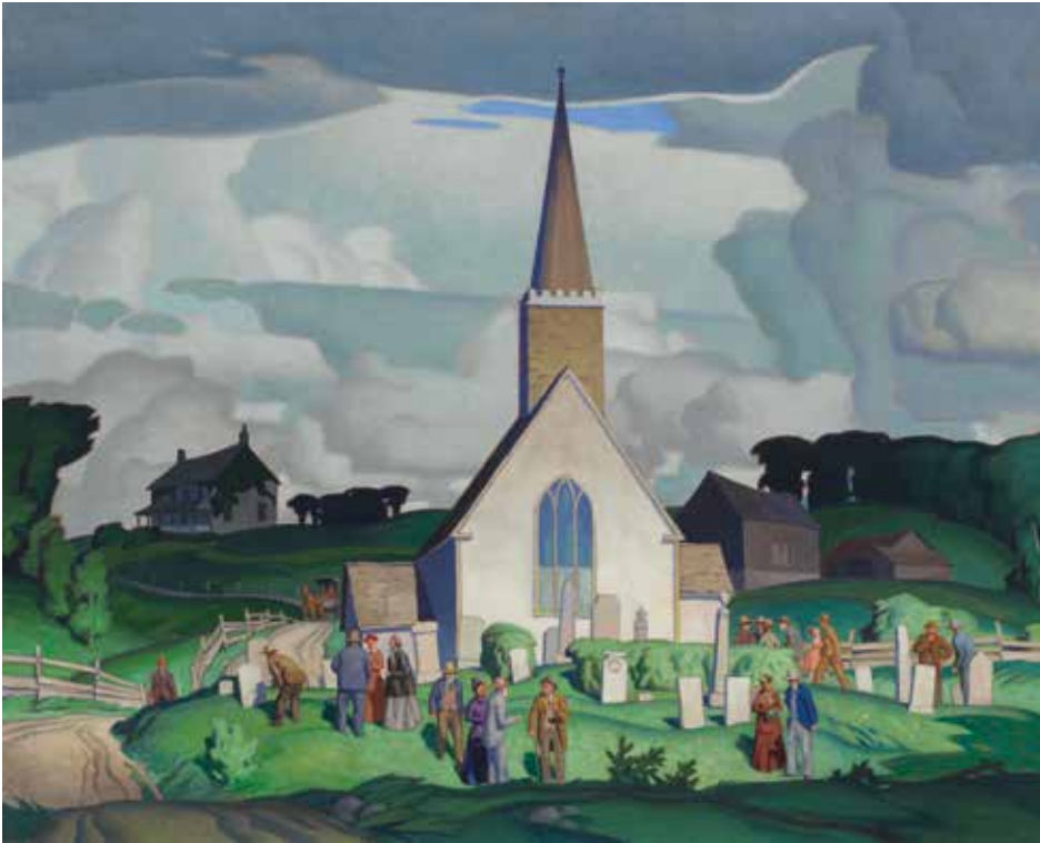
ALFRED JOSEPH (A.J.) CASSON Country Crisis oil on canvas, 1940, 37 x 45 inches Sold November 23, 2016 for a Record $1,534,000

On November 23, Heffel held the highest grossing art auction in Canadian history, as more than 200 important artworks were offered at our semi-annual live auction in Toronto. Starring museum-quality works by Group of Seven artist Lawren Harris, the auction achieved monumental sales of more than $42 million, soaring far above presale estimates of $22 million to $32 million. Passion for major masterpieces from bidders around the world resulted in the sale of eight individual works for more than $1 million each.