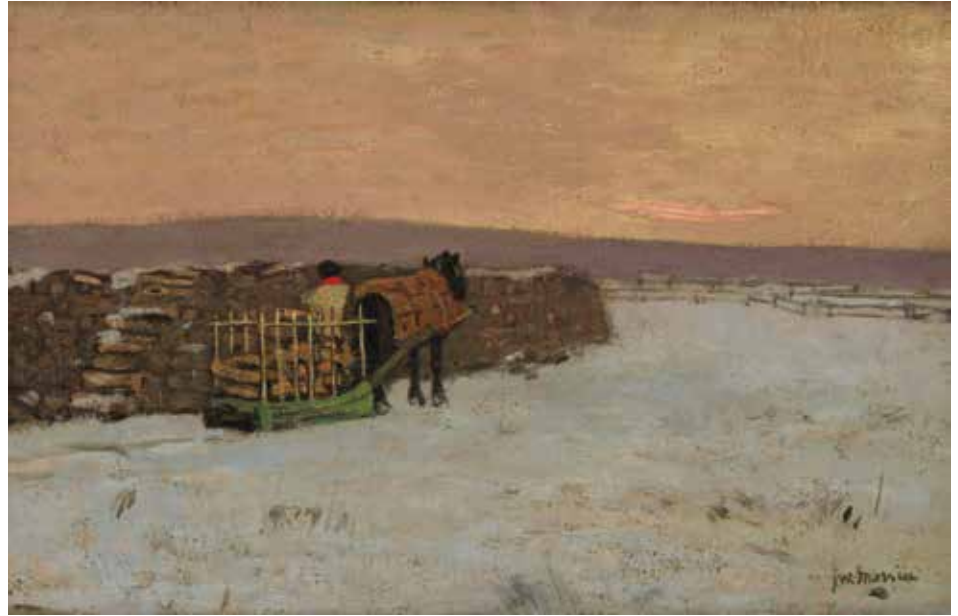
RIGHT: JAMES WILSON MORRICE The Woodpile, Sainte-Anne-de-Beaupré oil on canvas, circa 1900, 18 x 26 inches Sold November 23, 2016 for $1,180,000

collector's collection, and we look forward to the opportunity for continued success in single-consignor sales for future live auctions.