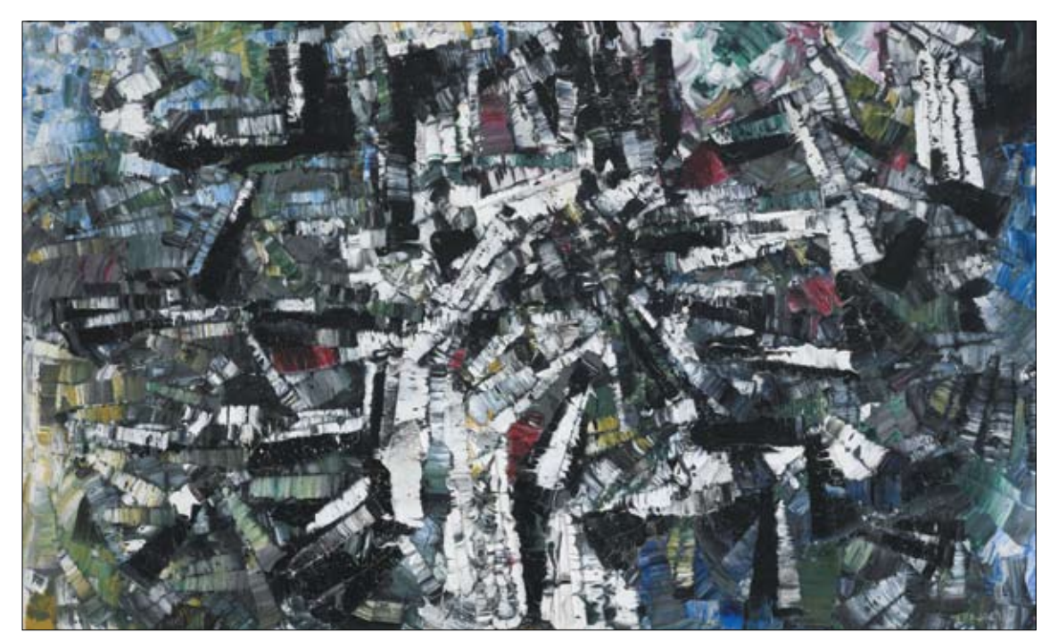
JEAN PAUL RIOPELLE, Ombrages, oil on canvas, 1955, 34 1/4 x 57 1/4 inches Sold November 27, 2014 for $1,003,000