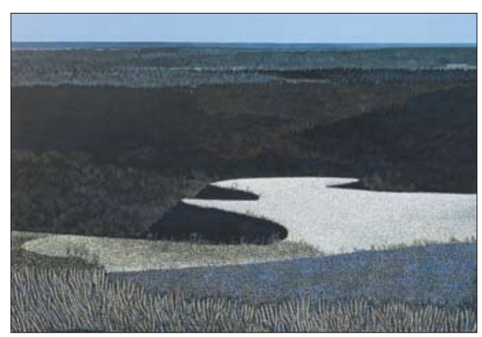
IVAN EYRE, Uplands , acrylic on canvas, 56 x 79 inches Sold November 27, 2014 for $318,600