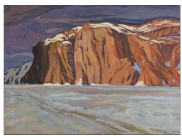
A.Y. JACKSON, Mazinaw Lake, March, Bon Echo, oil on canvas, 25 x 32 1/4 inches • Sold May 28, 2014 for $619,500

We are now accepting artworks for our two~session spring live auction of Canadian Post~War & Contemporary Art and Fine Canadian Art.