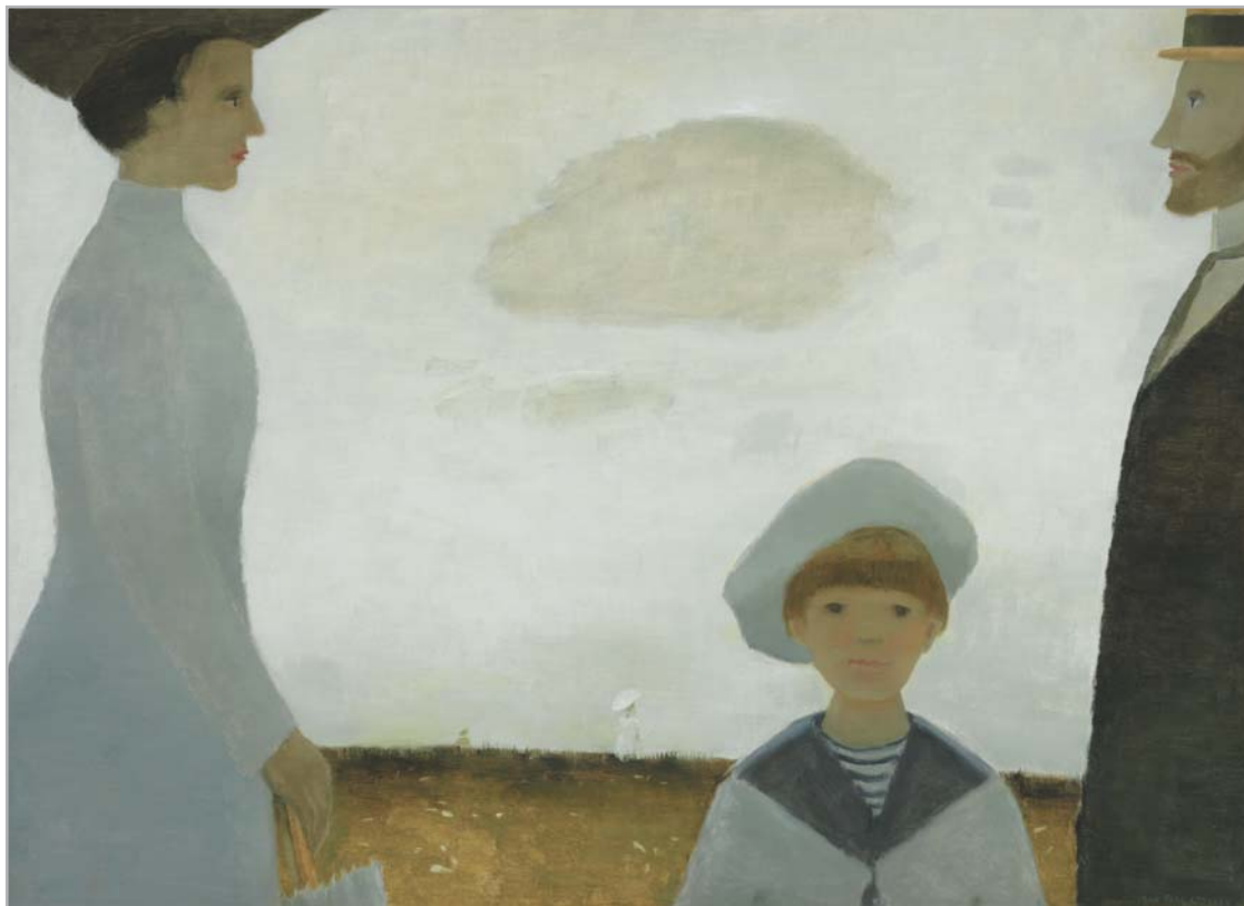
JEAN PAUL LEMIEUX Nineteen Ten Remembered oil on canvas, 1962 42 x 57 1/2 in, 106.7 x 146 cm Sold for a Record $2,340,000

The Canadian art market remains strong and Heffel Fine Art Auction House continues to lead the industry, now having hammered down all 12 of the top 12 highest dollar value live auctions of Canadian art in Canadian history.