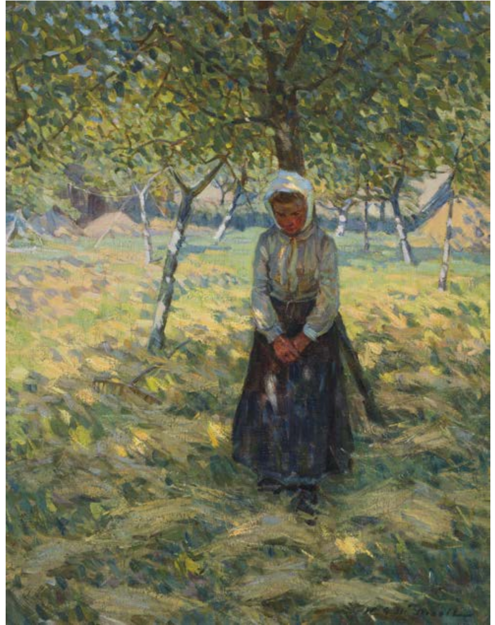
Helen Galloway McNicoll Girl in the Field

oil on canvas, circa 1927 – 1929 47 x 30 ¼ in, 119.4 x 76.8 cm ESTIMATE: $100,000 – 150,000