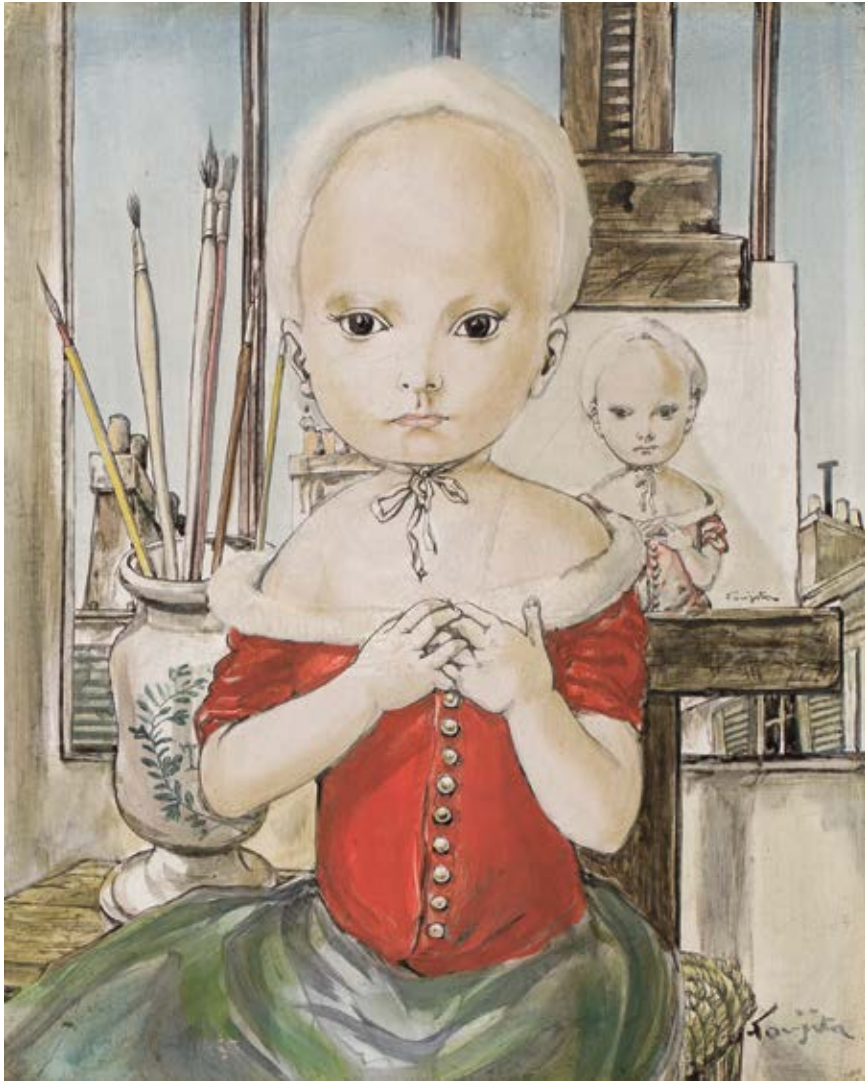
Léonard Tsuguharu Foujita Mon modèle