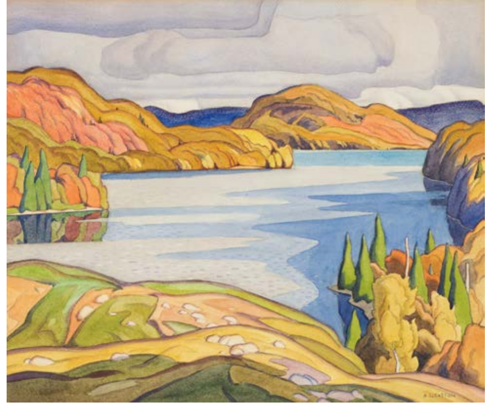
Alfred Joseph (A.J.) Casson Soyers Lake, Haliburton

watercolour on paper, 1929 17 x 20 in, 43.2 x 50.8 cm ESTIMATE: $40,000 – 60,000