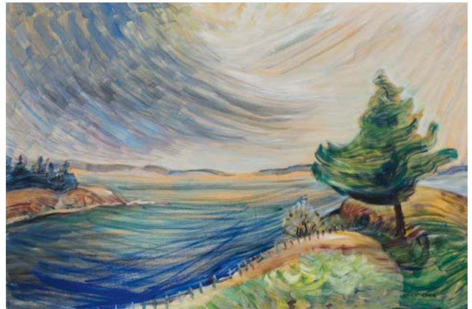
Emily Carr Telegraph Bay

oil on board, 1919 20 \frac{3}{4} x 22 \frac{1}{2} in, 52.7 x 57.2 cm ESTIMATE: $300,000 – 500,000