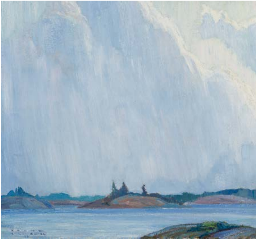
Franklin Carmichael Georgian Bay

oil on board, 1919 20 \frac{3}{4} x 22 \frac{1}{2} in, 52.7 x 57.2 cm ESTIMATE: $300,000 – 500,000