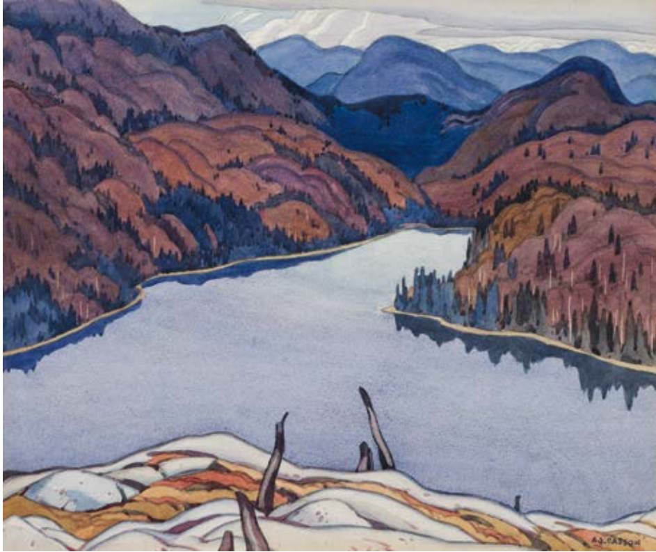
Alfred Joseph (A.J.) Casson The Lake in the Hills, Lake Superior

watercolour on paper, 1929 17 x 20 in, 43.2 x 50.8 cm ESTIMATE: $40,000 – 60,000