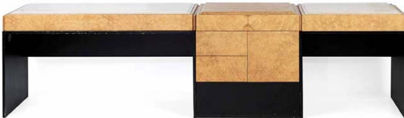
c) Office Drawer (5 separate units) maple burl wood and vener, wood, marble and bronze metal The 5 units can be placed all together or separately. The two drawer units can be locked with a key. 29 x 168 x 22 in, 73.7 x 426.7 x 55.9 cm