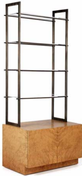
b) Shelf Cabinet maple burl wood and vener, bronze metal and plexiglass 84 x 36 x 22 3/8 in, 213.3 x 91.4 x 56.8 cm