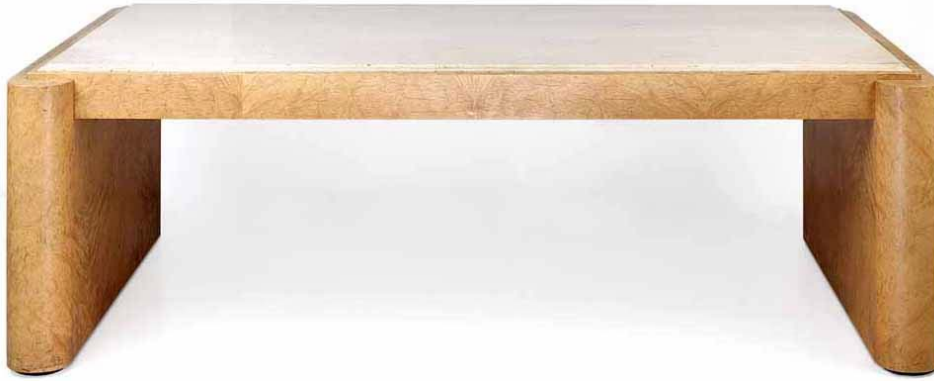
a) Desk maple burl wood and vener, marble and bronze metal 29 1/4 x 88 1/2 x 48 1/2 in, 74.3 x 224.8 x 123.2 cm