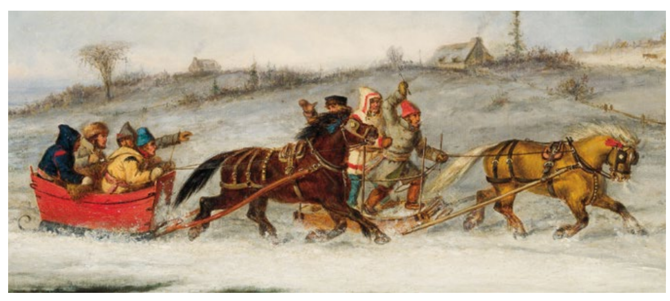
detail lot 134

Krieghoff produced a variety of compositions on related themes. From the early 1850s, the static groupings of the late 1840s were replaced by racing sleighs driven by canadiens in canvases variously titled Going to (or Returning from ) Town , Bilking the Toll , The Upset Sleigh or A Winter Incident , in which a sleigh forces another off the narrow road in a winter storm. While the themes are similar, each is interpreted in an original way, always with immense creativity and imagination. To the best of my knowledge, no painting is a direct copy of another painting by Krieghoff but always an inventive reworking.