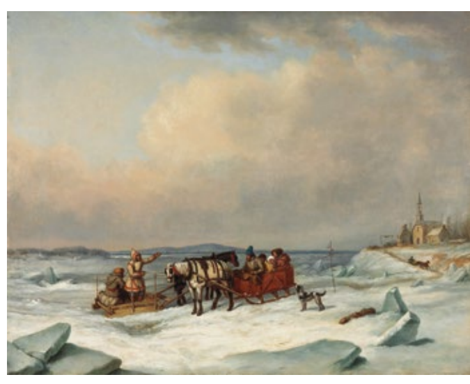
FIGURE 1: CORNELIUS KRIEGHOFF The Ice Bridge at Longue-Pointe oil on canvas, circa 1847 – 1848 24 × 30 in, 60.8 × 76.2 cm National Gallery of Canada Gift of Geneva Jackson, Kitchener, Ontario, 1933

Born in Amsterdam and having spent his youth in Bavaria, by 1846 Krieghoff had settled in Montreal, moving to Quebec City