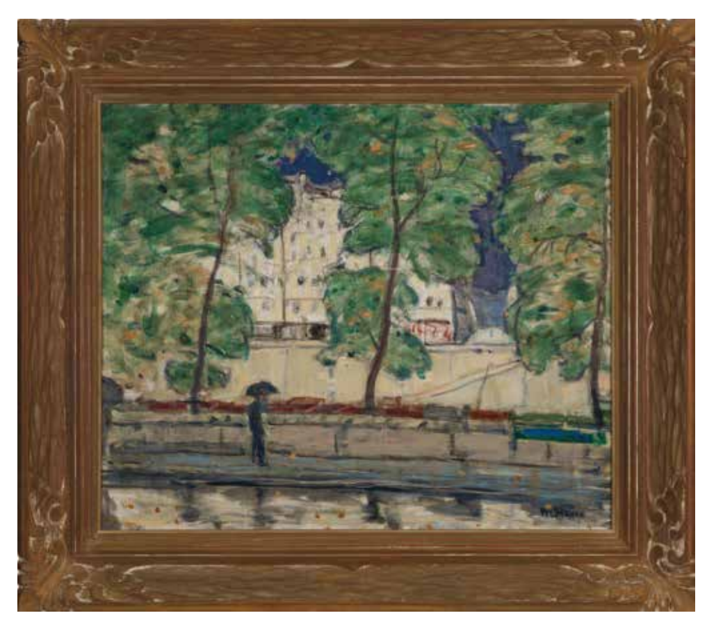
114 showing in its frame

When I arrived at my studio I found a most ghastly change—the shop next door is now an automobile shop—it is painted red—a beastly hot red—what one would naturally expect... At night there is a huge lantern with a large number & the