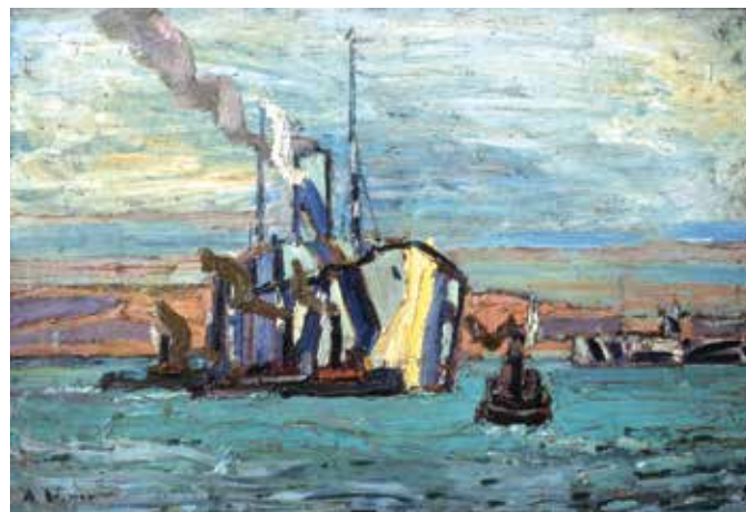
TOP: ARTHUR LISMER Camouflaged, Bedford Basin oil on board, 1918 15 ½ x 22 ½ in, 39.2 x 56.9 cm Private Collection

Lismer's first winter in Halifax was devoted to reorganizing the school, teaching, and re-establishing the Nova Scotia Museum of Fine Arts. He was able to paint around Bedford and the Sackville River, but sketching the military activities around the port