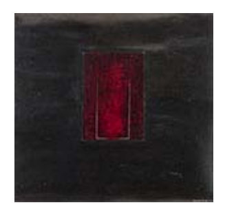
207 CAMROSE DUCOTE 1952 - Canadian