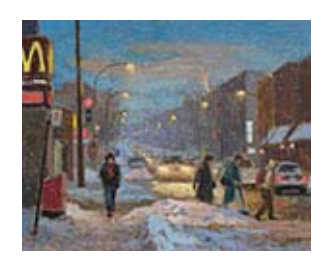
305 ANTOINE BITTAR