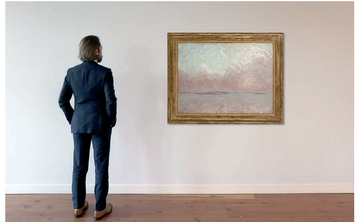
Lot 126 showing in its frame