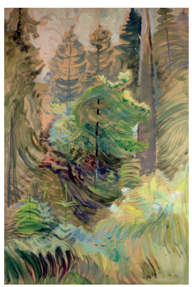
FIGURE 1: EMILY CARR Windswept Trees oil on paper, circa 1937 – 1938 33 × 21 ½ in, 83.8 × 54.6 cm University of Victoria Art Collection