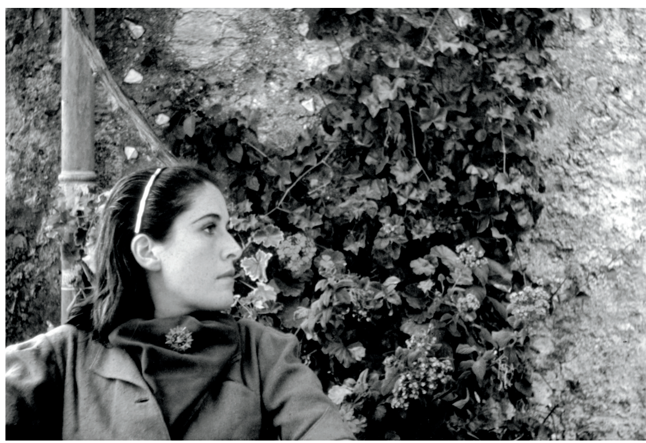
Dora Maar, Mougins, France, 1937