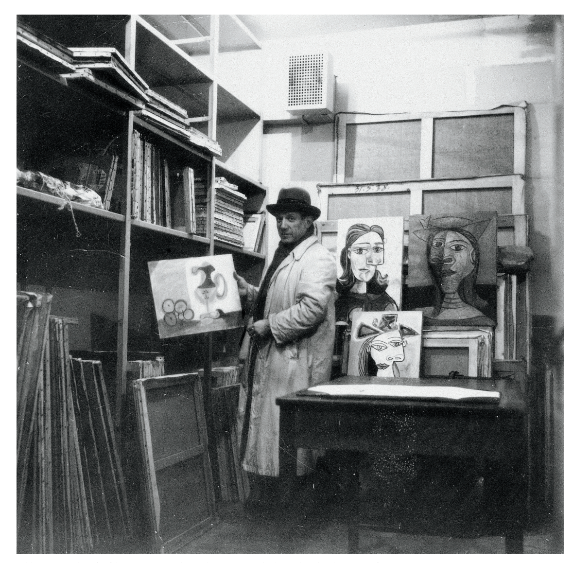
Pablo Picasso in the safe of the Banque nationale pour le commerce et l'industrie (BNCI) with portraits of Dora Maar, Paris, 1939

or another, or both, or various individuals. As a marker of the "realist" figurative subject, identity is repeatedly called into question in his "portraiture."