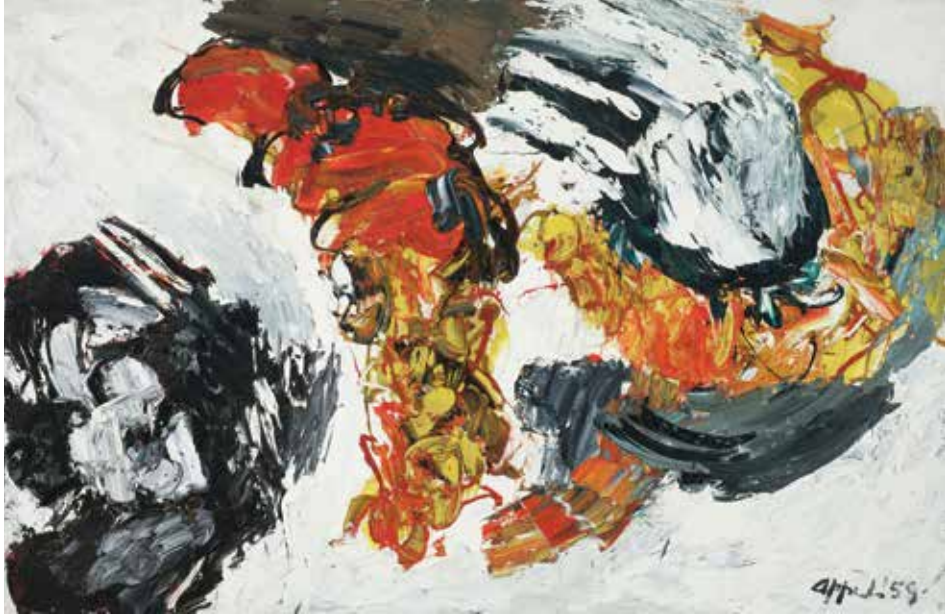
Karel Appel Comme les planètes

oil on canvas, 1959 51 x 76 ¾ in, 129.5 x 194.9 cm ESTIMATE: $250,000 – 350,000