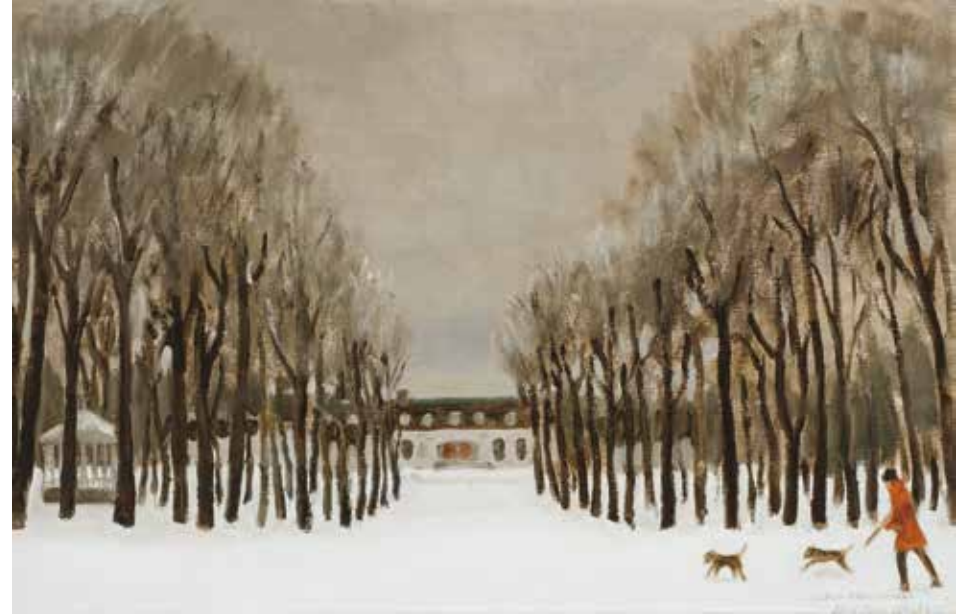
Jean Paul Lemieux La Seigneurie / Le manoir

oil on canvas, 1959 51 x 76 ¾ in, 129.5 x 194.9 cm ESTIMATE: $250,000 – 350,000