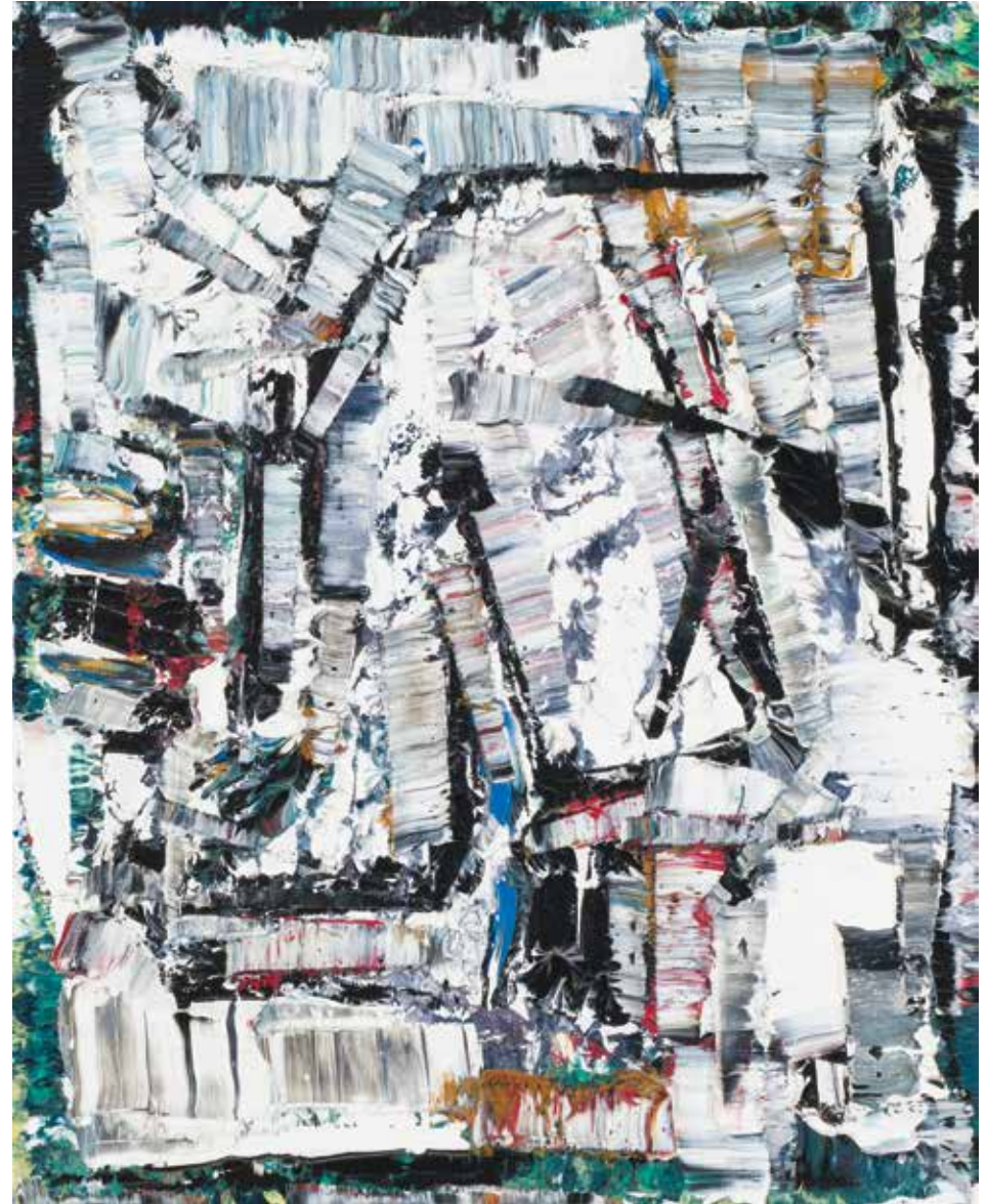
Jean Paul Riopelle Sans titre

oil on canvas, 1975 23 3/4 x 19 3/4 in, 60.3 x 50.2 cm