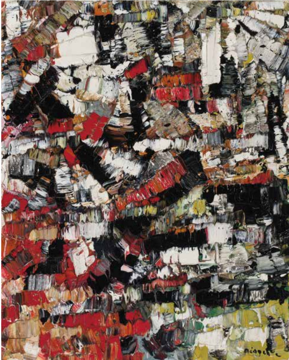
Jean Paul Riopelle Neige d'automne

oil on canvas, 1956 18 x 14 1/2 in, 45.7 x 36.8 cm