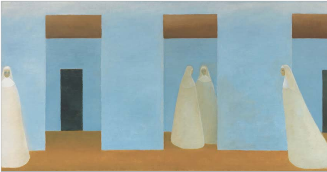
JEAN PAUL LEMIEUX, Les Moniales

“In Heffel’s May 2011 sale the high value market proved very strong. Heffel achieved a 100% sold success rate for all works offered valued over $300,000 and realized 167.43% value of their low pre-sale estimates.”