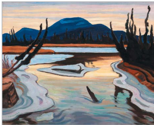
ALEXANDER YOUNG (A.Y.) JACKSON Smart River, Alaska Highway ESTIMATE: $125,000 ~ $175,000 Sold for $479,700

Founded in Vancouver, BC, Heffel Fine Art Auction House has conducted the top 11 highest value live auctions of Canadian art. The auction house is led by an experienced team of fine art specialists and has a national presence with offices in Vancouver, Toronto, Ottawa, Montreal and Calgary. As the industry leader, Heffel holds over 60% market share of worldwide Canadian art auction sales, with over $275 million in art auction sales since 1995. We publish our entire live auction online at www.heffel.com , from initial promotion and illustrated lot listings to the auction's live multi-camera webcast and final sale results. Heffel represents your fine artworks respectfully in our printed catalogues, online presentation and in previews across Canada, and reaches a vast North American, Asian and European client base. Our attention to every detail, our reputation for handling works of the finest quality, rarity, provenance and ~ of paramount importance ~ with the appropriate estimate, produce outstanding results.