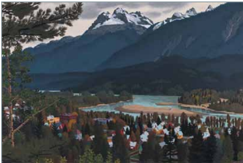
E.J. HUGHES (top / haut) Revelstoke and Mount Begbie oil on canvas, signed, 1962 24 x 35 in, 61 x 88.9 cm ESTIMATE: $125,000 ~ 175,000