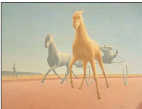
ALEXANDER COLVILLE Two Pacers tempera on board 24 x 32 in ESTIMATE: $200,000 ~ $300,000 Sold for a record $690,000