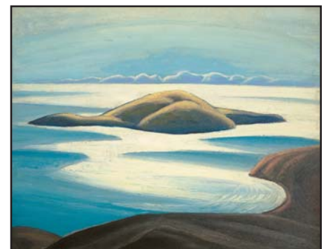
LAWREN STEWART HARRIS Lake Superior Sketch X (Pic Island) oil on board 12 x 15 in ESTIMATE: $300,000 ~ $500,000 Sold for $575,000