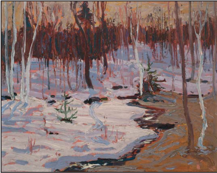
TOM (THOMAS JOHN) THOMSON Spring Woods oil on board 8 1/2 x 10 1/2 in ESTIMATE: $300,000 ~ 400,000 Sold for a record $1,035,000