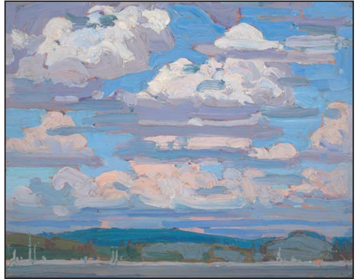
TOM (THOMAS JOHN) THOMSON Summer Clouds oil on board 8 1/2 x 10 1/2 in ESTIMATE: $300,000 ~ 400,000 Sold for a record $1,035,000

canvas, was painted in 1915 while Milne was living in New York City. The work sold for $103,500.