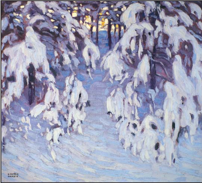
LAWREN STEWART HARRIS