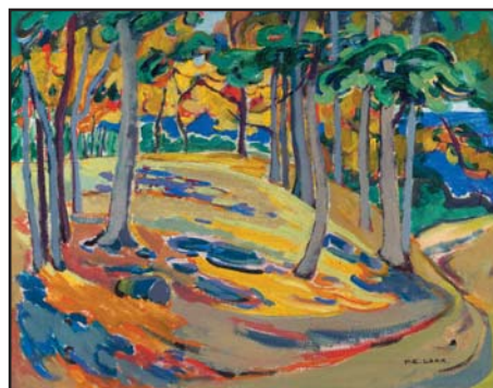
EMILY CARR Oak Wood oil on canvas 15 x 19 in ESTIMATE: $200,000 ~ $300,000 Sold for $661,250