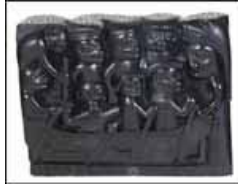
Lot # 005 EARLY HAIDA ARTIST 19th Century Canadian Indigenous

View Heffel's Top Results by this artist