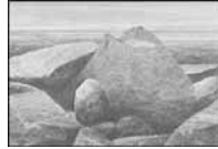
e) Untitled (Rocks)

lithograph on paper signed in the plate 9 1/2 x 13 7/8 in