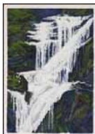
Lot # 119 GORDON APPELBE SMITH BCSFA CGP CPE OC RCA 1919 - Canadian

View Heffel's Top Results by this artist