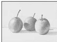
a) Untitled (Three Pears)

Portfolio of Black and White Prints of Drawings (Six Works) signed, editioned Artist's Printers Proof and dated 1981 on the cover sheet of the portfolio