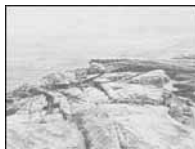
c) Untitled (Shore)

lithograph on paper signed in the plate 9 1/2 x 13 1/8 in