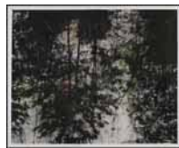
Lot # 118 GORDON APPELBE SMITH BCSFA CGP CPE OC RCA 1919 - Canadian

Reflections No. 1 silkscreen on paper, signed, titled, editioned A.P. No. 1 and dated 2001 19 x 24 in, 48.3 x 61 cm