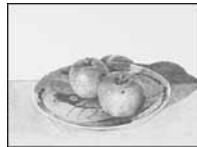
f) Untitled (Two Apples)

lithograph on paper signed in the plate 9 1/2 x 13 7/8 in