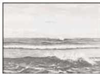
b) Untitled (Waves)

lithograph on paper initialled in the plate 10 x 13 in