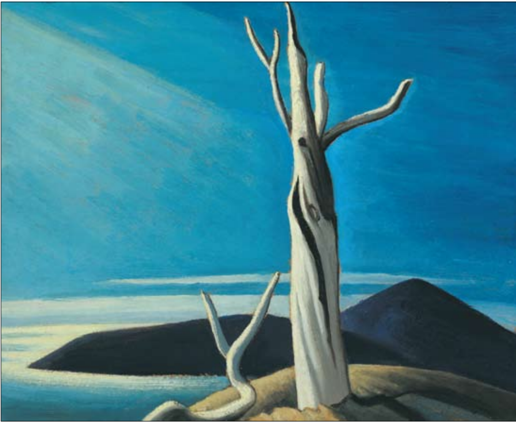
LAWREN HARRIS, Lake Superior Sketch LXI , oil on board, circa 1926 ~ 1928, 12 x 15 inches Sold May 28, 2014 for $973,500