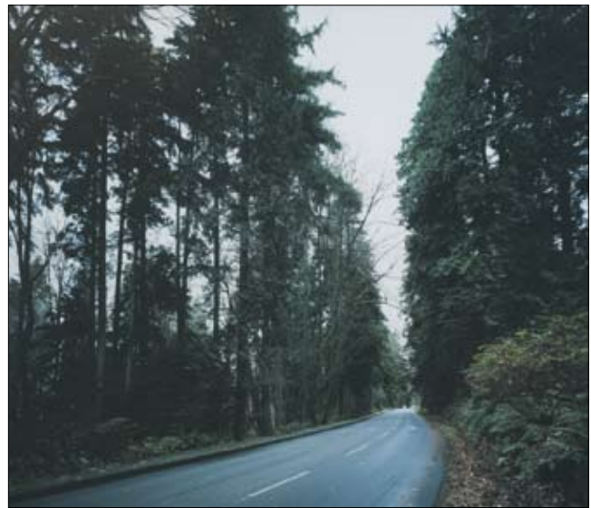
JEFF WALL, Park Drive To be offered November 27, 2014

We are now accepting artworks for our two-session fall live auction of Canadian Post-War & Contemporary Art and Fine Canadian Art.