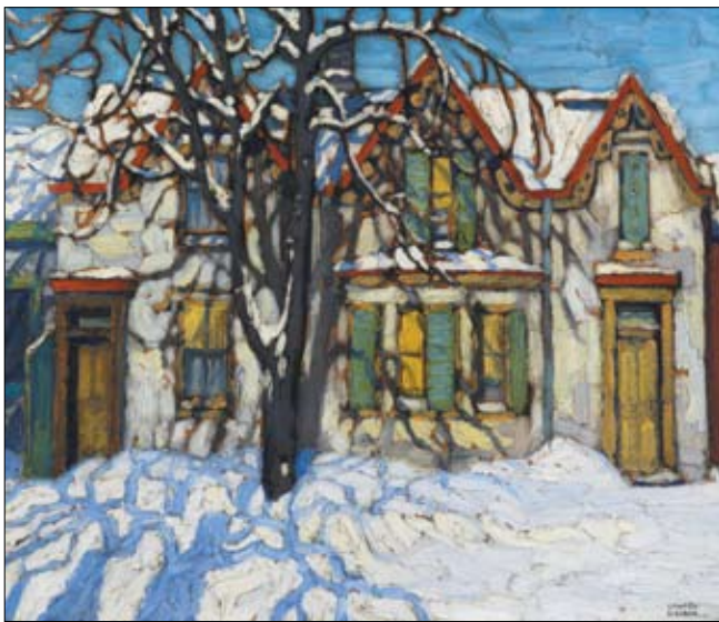
LAWREN STEWART HARRIS, Houses on Gerrard Street To be offered November 27, 2014