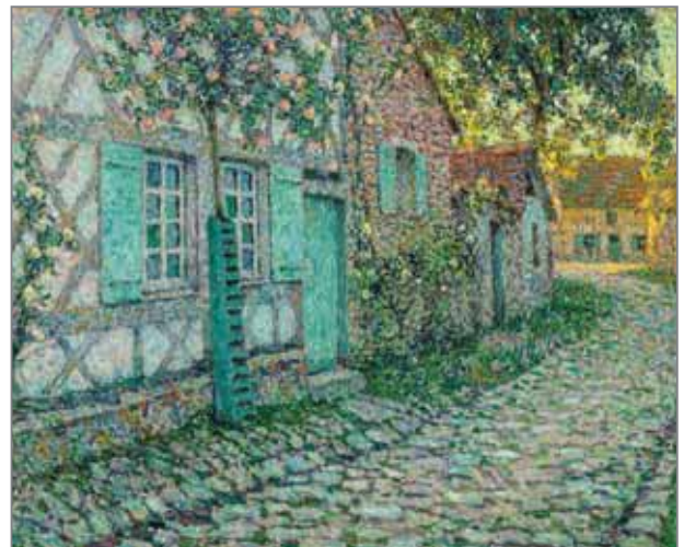
HENRI EUGÈNE LE SIDANER

We are now accepting artworks for our two-session fall live auction of Canadian Post-War & Contemporary Art and Fine Canadian Art