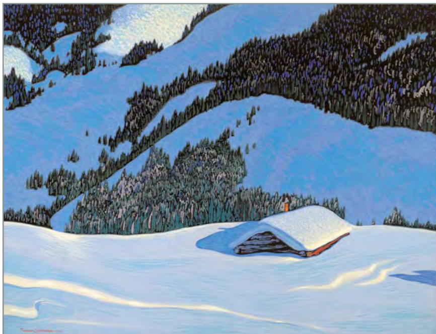
FRANK HANS (FRANZ) JOHNSTON Snowed In tempera on board, signed and dated 1924 30 x 40 in, 76.2 x 101.6 cm ESTIMATE: $60,000 ~ 80,000