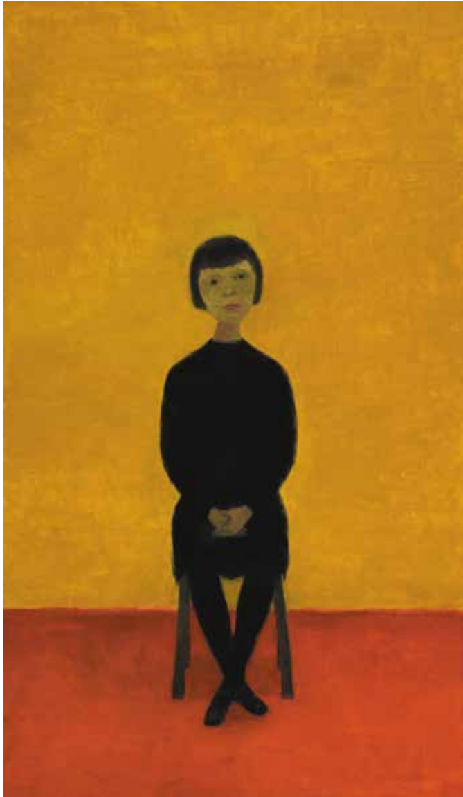
Jean Paul Lemieux La petite fille

oil on canvas, signed and dated 1970 48 x 27 ¾ in, 121.9 x 70.5 cm ESTIMATE: $100,000 – 150,000