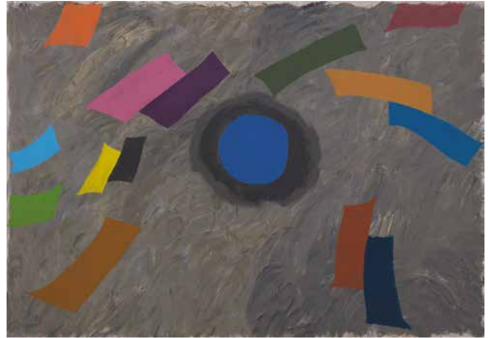
Jack Bush Moon Gust

mixed media on board, signed and dated 1959 56 x 38 in, 142.2 x 96.5 cm ESTIMATE: $90,000 – 120,000