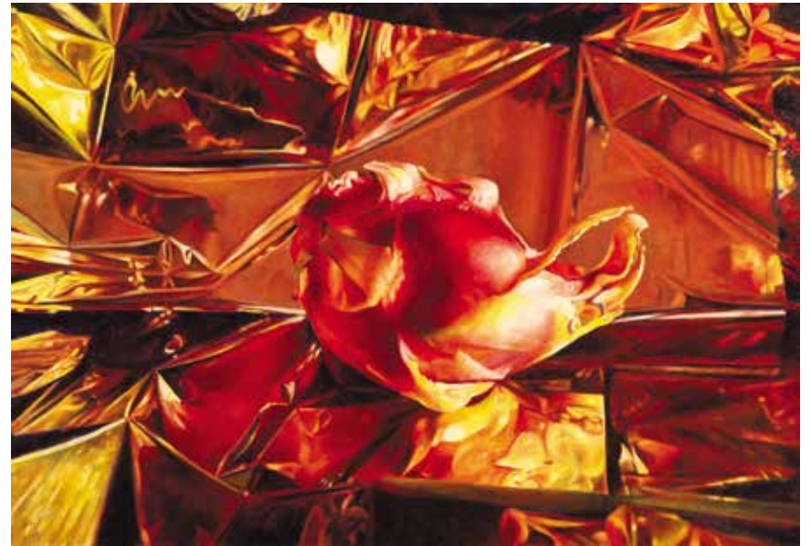
Mary Pratt Foiled in Gold

oil on board, signed and dated 1971 13 x 21 in, 33 x 53.3 cm ESTIMATE: $50,000 – 60,000