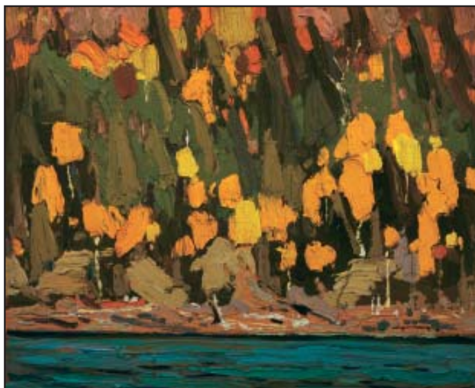
THOMAS JOHN (TOM) THOMSON